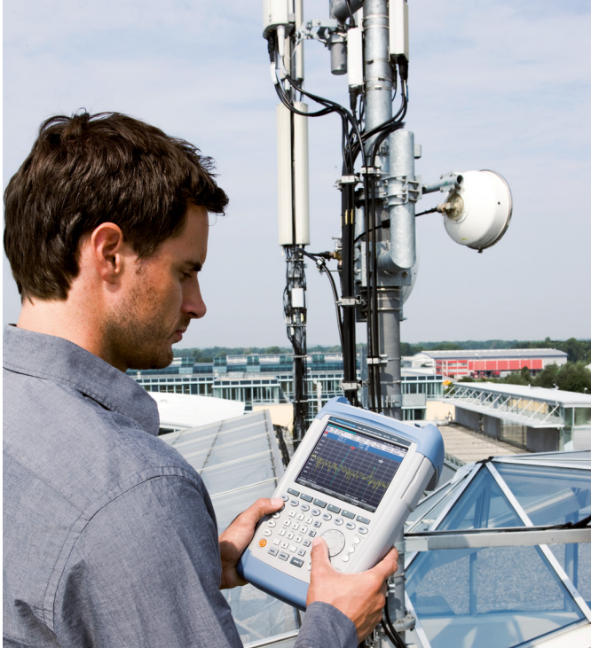
Unique test solution for remote radio heads in the field.

In combination with the R&S®FSH handheld spectrum analyzer, the R&S®EX-IQ-Box digital signal interface module significantly simplifies RRH installation and inspection in distributed network architectures.